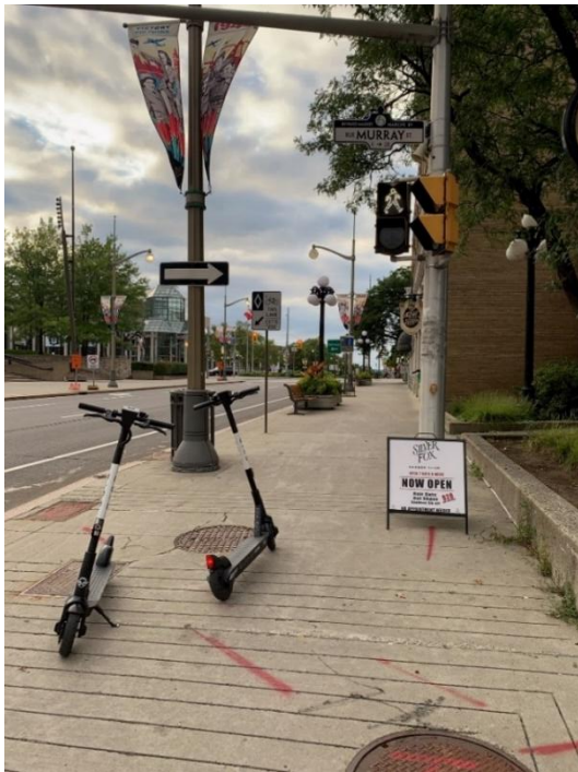
Two Bird e-scooters blocking sidewalk and crosswalk in Byward Market, Ottawa