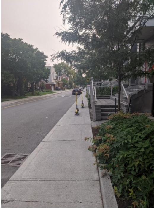
Two Roll e-scooters parked in middle of sidewalk on Holmwood Avenue, Ottawa