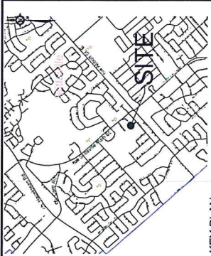
KEY PLAN M15