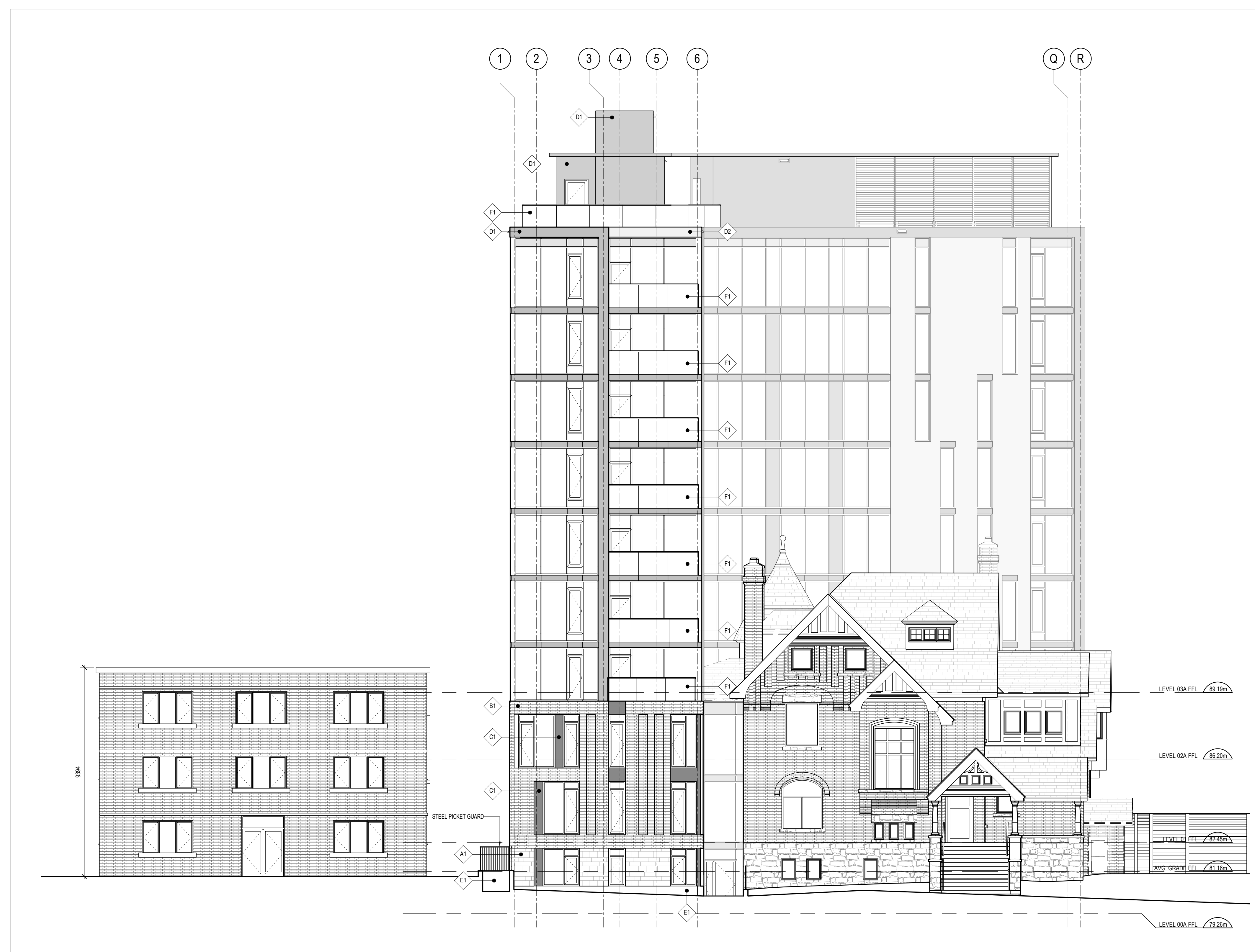
1 SOUTH ELEVATION A201 SCALE: 1 : 100

GENERAL ARCHITECTURAL NOTES: 1. This drawing is the property of the Architect and may not be reproduced or used without the expressed consent of the Architect. 2. Drawings are not to be scaled. The Contractor is responsible for checking and verifying all levels and dimensions and shall report all discrepancies to the Architect and obtain clarification prior to commencing work. 3. Upon notice in writing, the Architect will provide written graphic clarification or supplementary information regarding the intent of the Contract Documents. 4. The Architectural drawings are to be read in conjunction with all other Contract Documents including Project Manuals and the Structural, Mechanical and Electrical Drawings. 5. Positions of exposed or finished Mechanical or Electrical devices, fittings and fixtures are indicated on the Architectural Drawings. Locations shown on the Architectural Drawings shall govern over Mechanical and Electrical Drawings. Mechanical and Electrical items not clearly located will be located as directed by the Architect. 6. These documents are not to be used for construction unless specifically noted for such purpose.