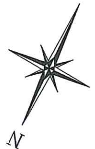
1 SITE PLAN SP1 SCALE: 1:300