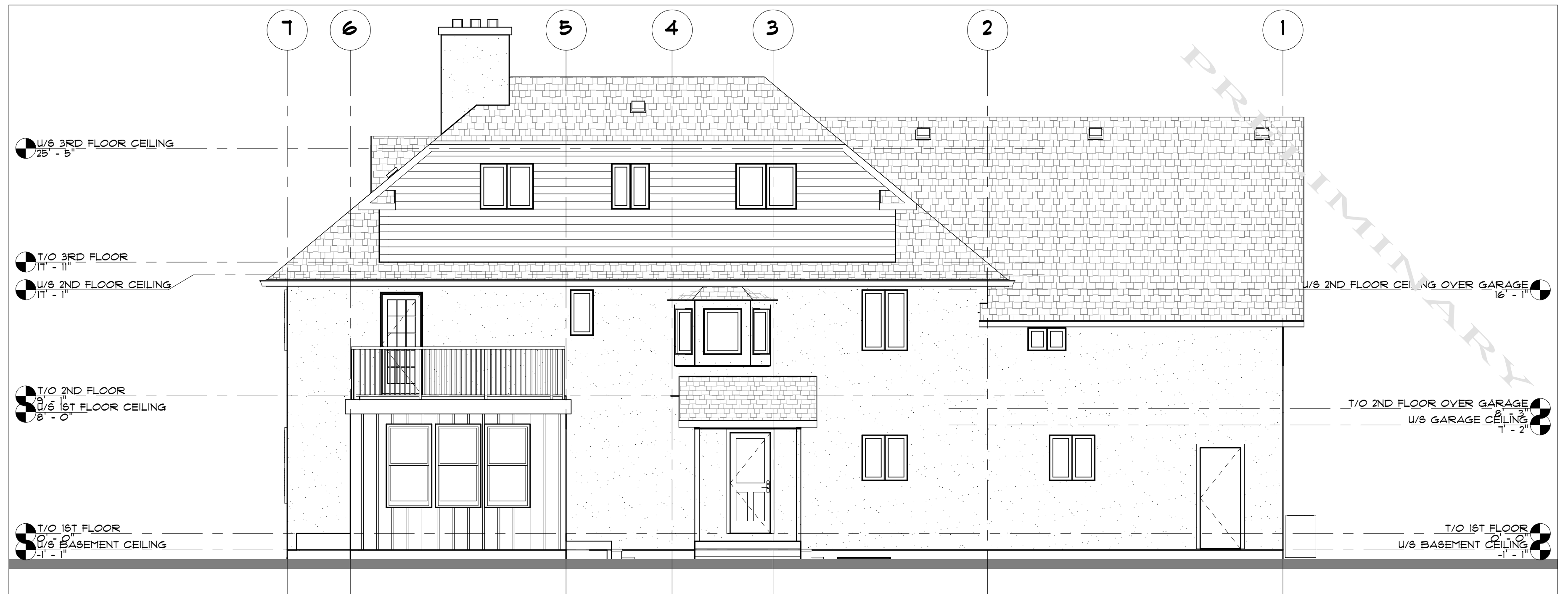
1 REAR ELEVATION 6 SCALE: 3/16" = 1'-0"