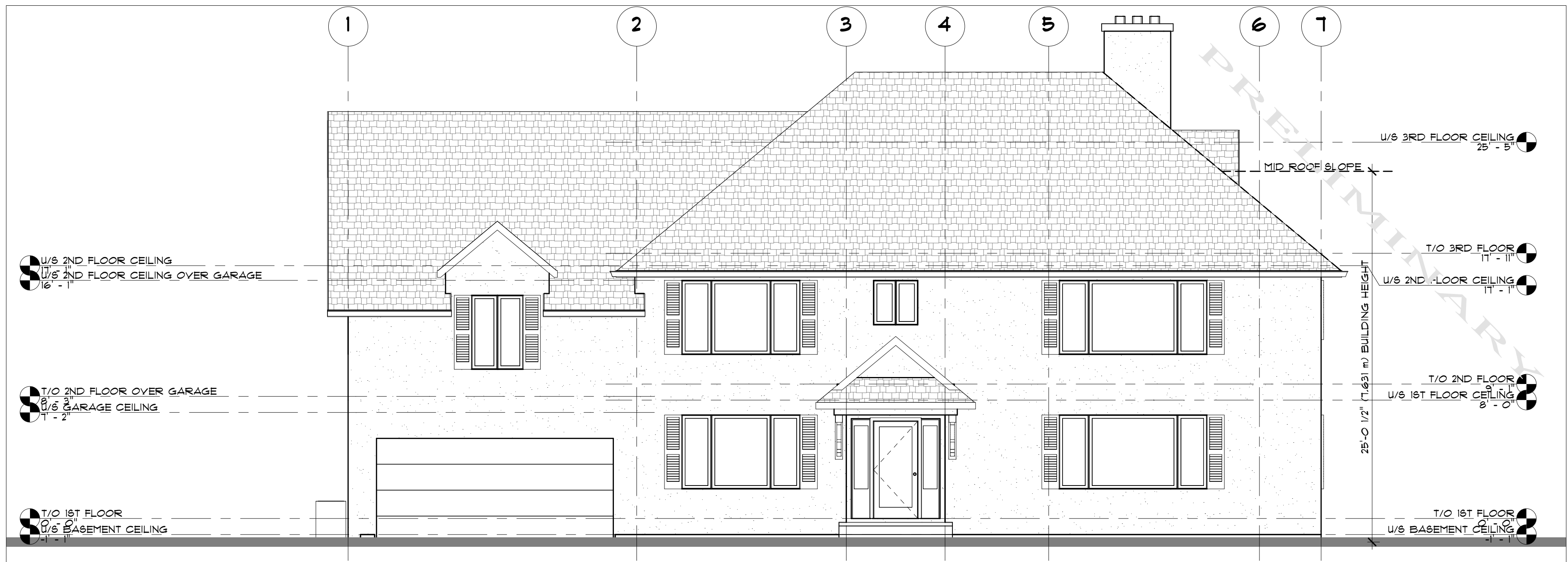
1 FRONT ELEVATION 5 SCALE: 3/16" = 1'-0"