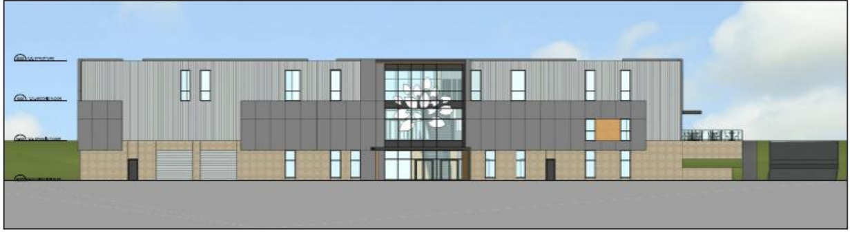
3 NORTH ELEVATION A405 1/200