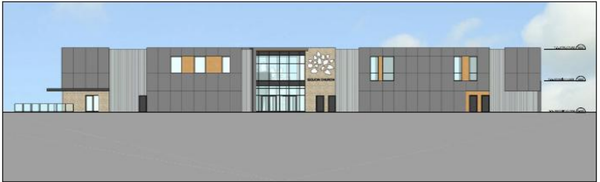
1 SOUTH ELEVATION A405 1/200