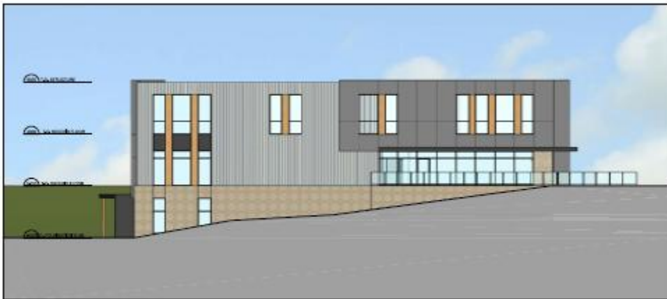
2 WEST ELEVATION A405 1/200