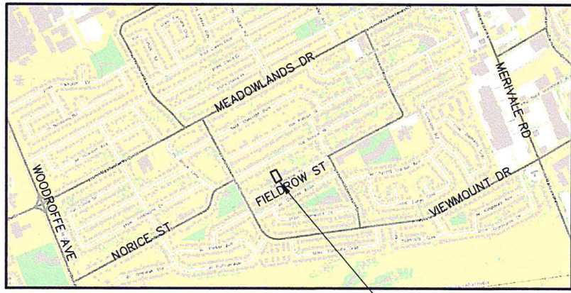
KEY PLAN (NTS) LOT LOCATION

Minor Variances Requested: a) To permit a reduced lot width of 16.65 metres on Part 1, whereas the By-law requires that the lot width is greater than 19.5 metres. b) To permit a reduced lot width of 16.63 metres on Part 2, whereas the By-law requires that the lot width is greater than 19.5 metres.