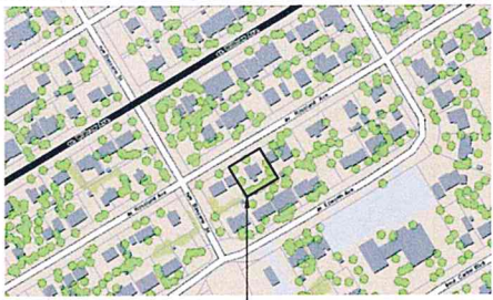
KEY MAP SCALE: NTS