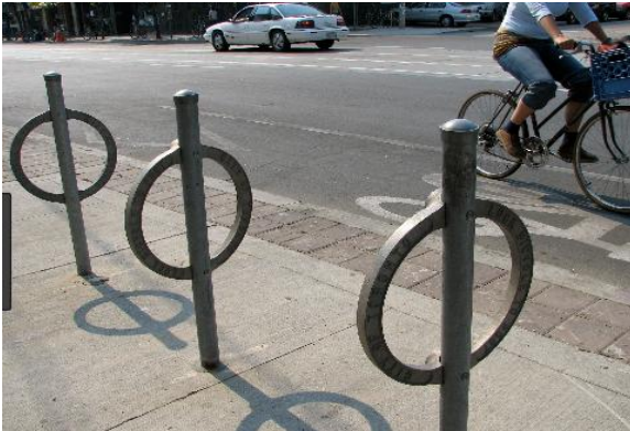
Bike rings in strategic cycling locations