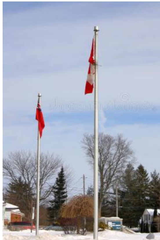
Flag poles (various locations)