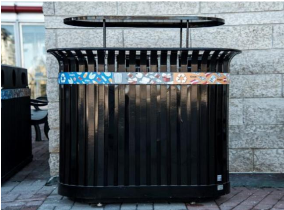
Waste receptacles – village centre