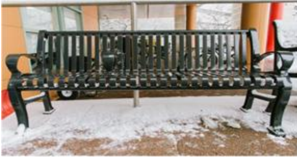
Benches on new concrete pads