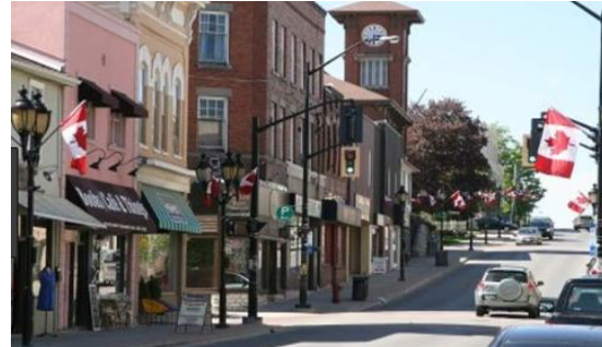
Pole banners/flag holders/basket holders