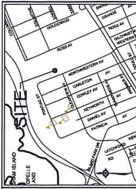
KEY PLAN NT3