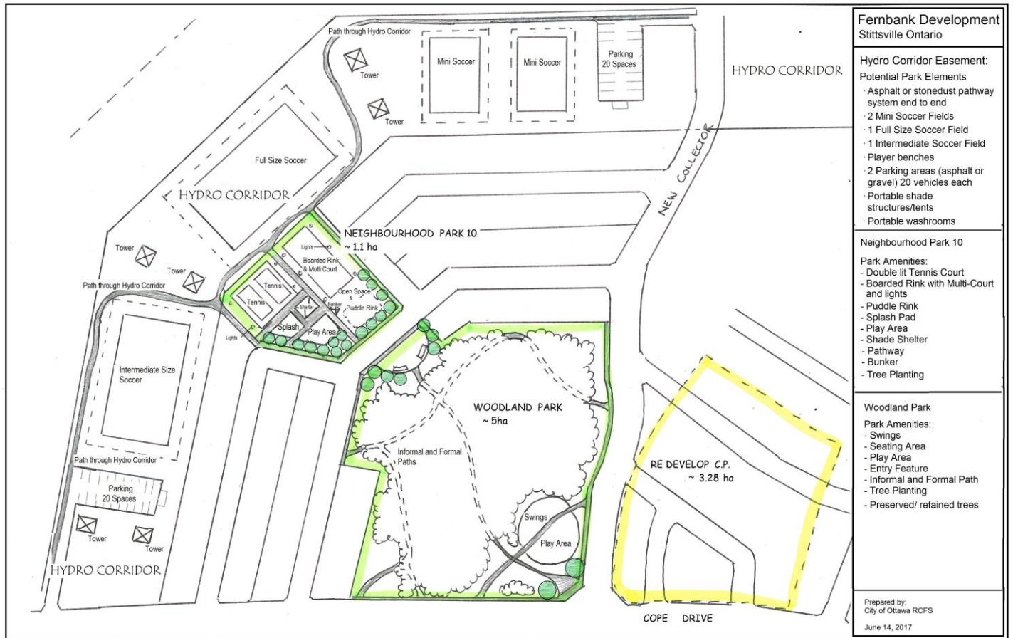
FIGURE 3: POSSIBLE DESIGN SCENARIO

In order to accommodate the communities' needs for recreational amenities it is proposed that the playing fields and parking areas be provided within the hydro corridor, figure 3.